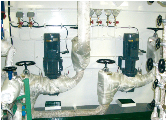
Fig. 2: Fuel Oil Feeder and Booster Pump L3NG with magnetic coupling