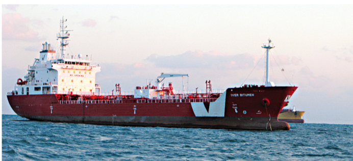
Fig. 3: Bitumen Tanker

Deck installations of cargo screw pumps usually are not able to satisfactorily unload the full range of cargo viscosities in tanks with depths of