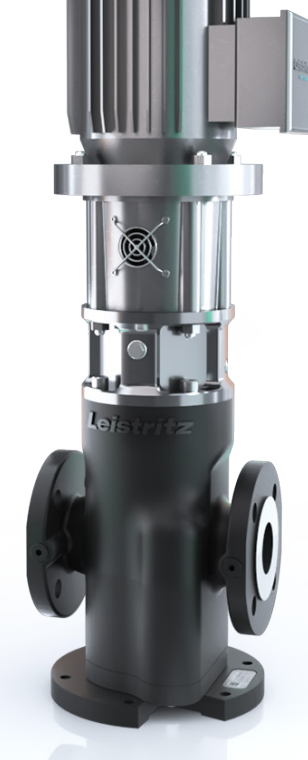
FLANGE PUMP PEDESTAL PUMP INCL. LANTERN AND MOTOR